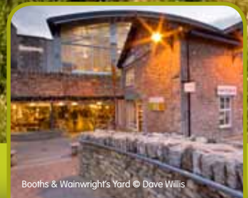
Booths & Wainwright's Yard