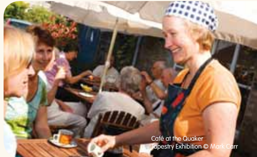
Café at the Quaker Tapestry Exhibition

The town also hosts a farmer's market on the last Friday of each month.