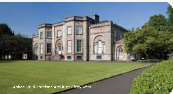
Abbot Hall

It was the woollen industry that brought fame and wealth to the town and sustained its economy for over 600 years - Kendal's motto of Pannus mihi panis which translates as 'Cloth (or wool) is my bread'.