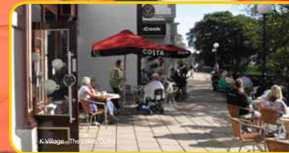
K Village – The Lakes Outlet