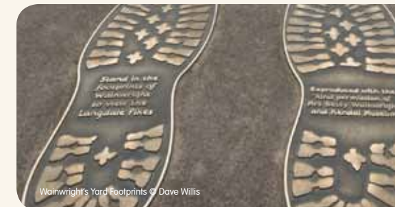
Wainwright's Yard Footprints