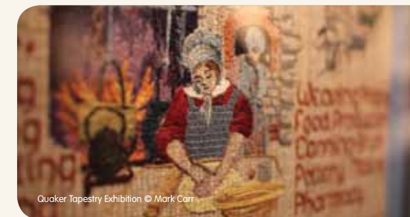
Quaker Tapestry Exhibition

For peaceful grassed areas ideal for picnics and quiet relaxation discover Abbot Hall Park with bowling green and children's play area. Nobles Rest and Maude's Meadow is a peaceful grassed area with a woodland backdrop and Goose Holme, a grassed area next to the river with an 18-hole putting green (open in the summer).