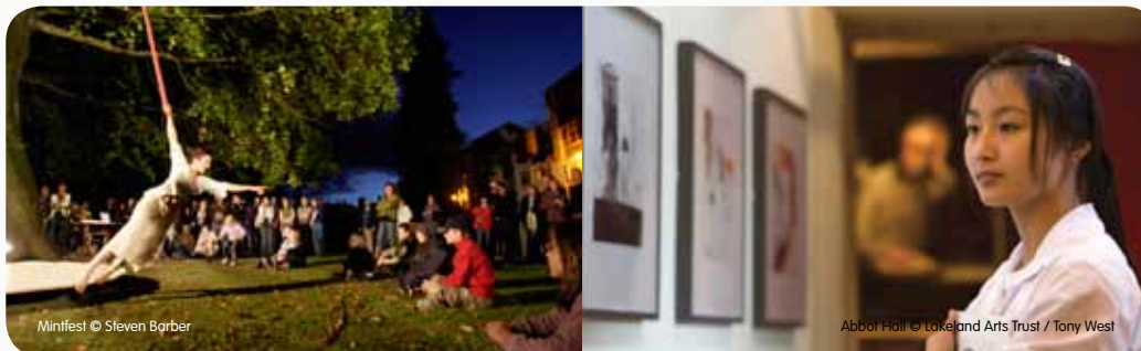
Mintfest