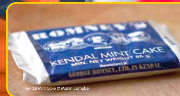
Kendal Mint Cake