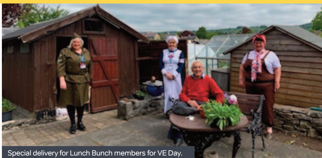
Special delivery for Lunch Bunch members for VE Day.