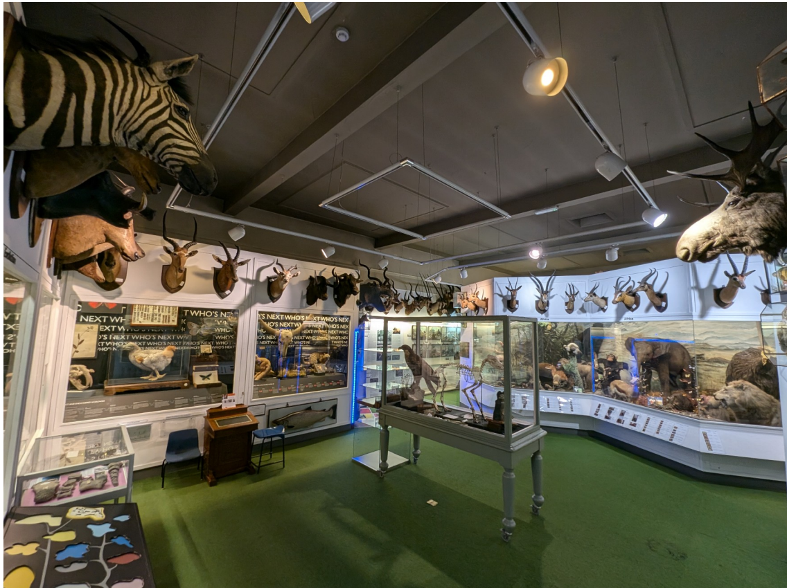
A view of the entrance to the World Wildlife Gallery, November 2024. The mounted animal heads, or 'hunting trophies' on display are Harrison's, from east African Zebra (top left), through to Alaskan Moose (top right).

above the other artefacts, looking down on both the other specimens and gallery visitors. In total Harrison donated over 80 such trophy heads to the museum, along with dozens of cases of taxidermy birds, preserved moths and butterflies, and a small number of cultural artefacts. 2