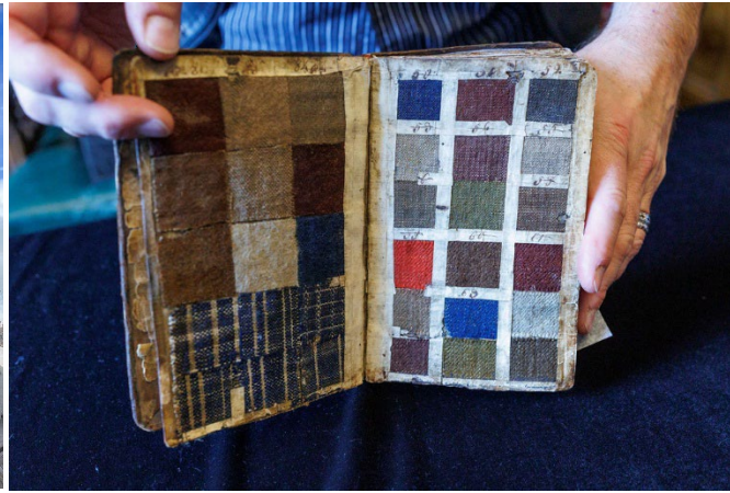
Kendal Pattern Book of 1769

This year has been one of meaningful collaboration and forward momentum for Kendal. By strengthening key partnerships, we've helped promote the town's culture, support its heritage, and invest in projects that will benefit our community for years to come. From enhancing how people discover Kendal, to uniting organisations around heritage preservation and cultural ambition, we're proud of the foundations we've built—and excited for what these partnerships will enable in the future.