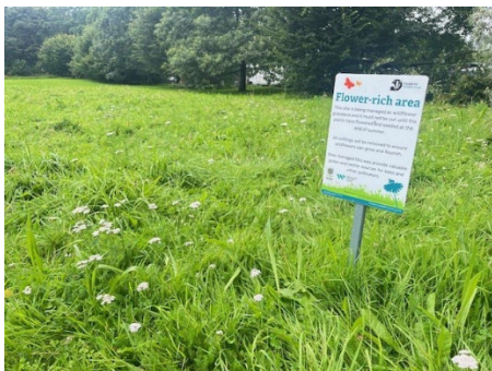
Pollinator Planting Site – Kendal Green