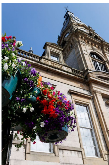
Civic planting outside Town Hall