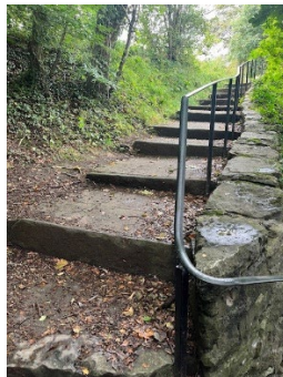
Handrails at Bowling Fell – Bowling Fell and Castle Howe