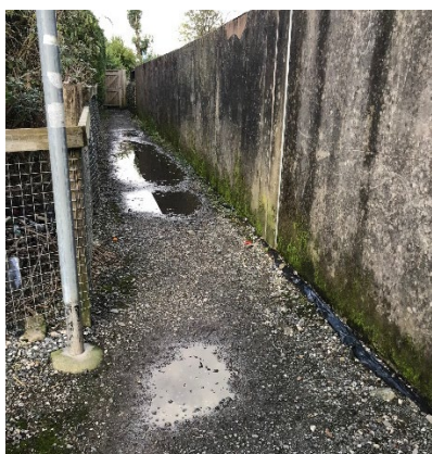
Before and after footpath improvements at Vicarage Drive