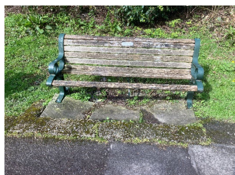
Bench repairs before and after