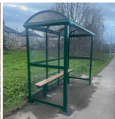
Replacement bus shelter at Castle Green Lane